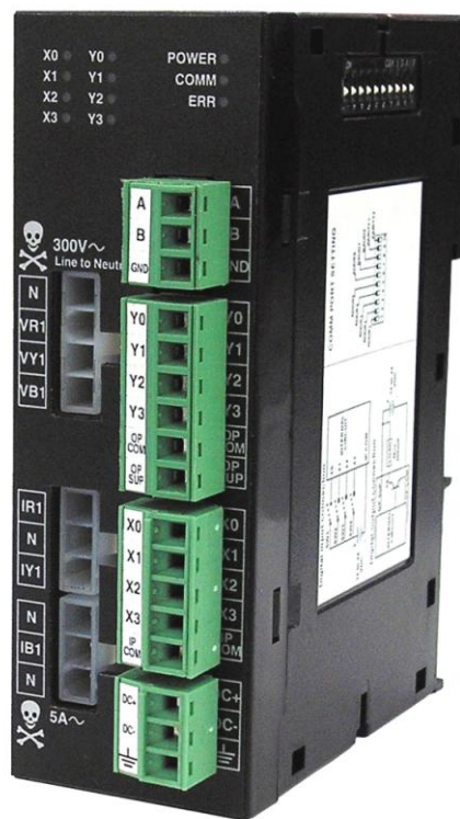
Energy Measurement Module with Digital I/O